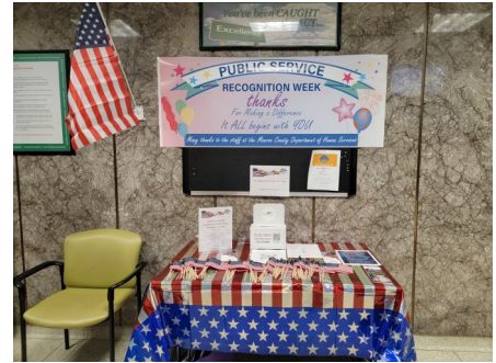
West Fall Rd Flag Day Table