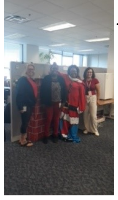
Teams 3 and 8 Rocking the Red