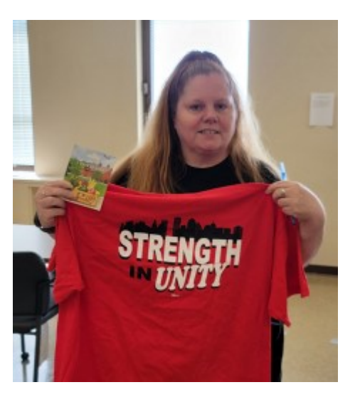
Red Shirt Raffle Winners August 2023