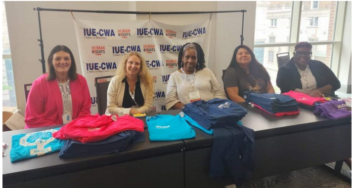
Below: FSW helped out at the Women's Committee /Human Right's table during registration