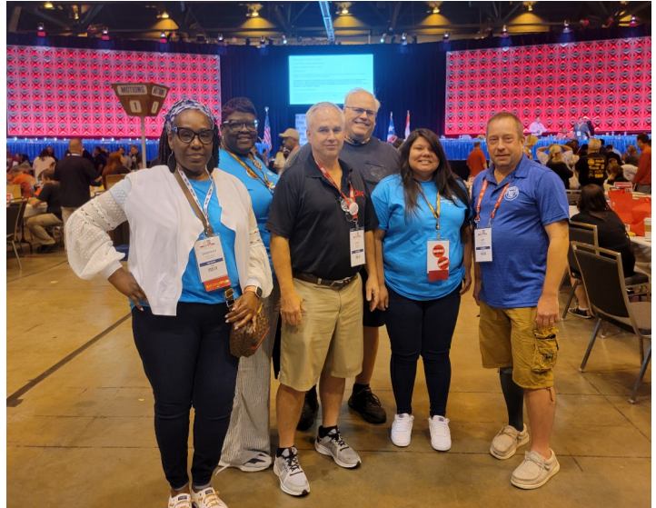
Right: Pictured with other CWA locals from Rochester, 1170 (Frontier) and NABET 22 (Channels 8 & 10)