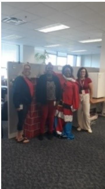
Teams 3 and 8 Rocking the Red