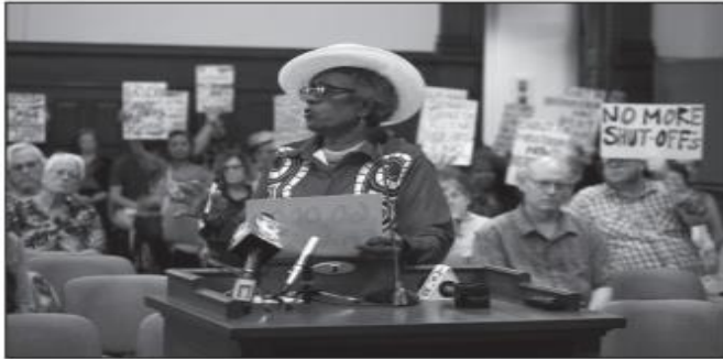
All photos taken pre-COVID. Masks required and social distancing practiced for all current volunteer activities.

Score a touchdown with ESWA! Join the Winter Survival Campaign and the Super Bowl Tamale and Tex-Mex Soup Benefit to prevent winter tragedies and build year-round organization for low-income workers as a material manifestation of hope. Call ESWA to volunteer, and order your tamales today!